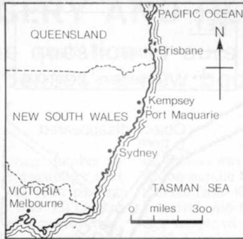
Map of Eastern Australia showing the location of Kempsey